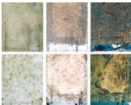
Flat (top) and wrinkle-protected samples.

To prevent the accumulation of unwanted microorganisms, plants, and animals on surfaces exposed to a marine environment, coatings are applied to the submerged surface. One challenge in creating such a coating is that the critical length scales involved in organism attachment range from hundreds of nanometers to centimeters. Efimenko et al. have developed polymer coatings that possess a hierarchical wrinkled structure. They stretched and then cross-linked the surface of poly(dimethylsiloxane), after which they applied a fluorinated silane monolayer. On gentle relaxation of the stress, a rippled surface layer formed, wherein each wrinkle had smaller-scale wrinkles on top of it that themselves bore even smaller wrinkles, proceeding over five generations. In seawater tests, flat polymer films showed fouling after a few